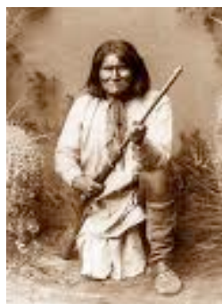
Exhibit opening in Tucson – GERONIMO! Revered and Reviled Friday, June 11, 2010; 5:00 p.m. – 7:00 p.m.

AHS Arizona History Museum, 949 E. 2nd St., Tucson, AZ 85719 Phone: 520-628-5774 Free parking one block west of the museum in the Arizona Historical Society garage at the northeast corner of E. 2nd St. and N. Euclid Ave. Use the E. 2nd St. entrance.